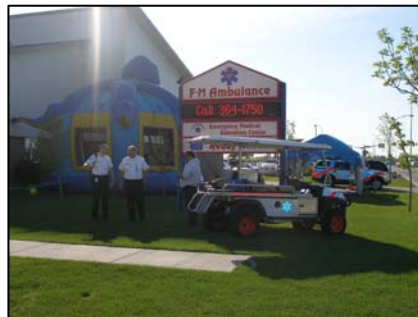
Many different people helped out and participated in the open house