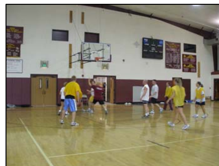
Team members show off their basketball skills after the dodgeball game