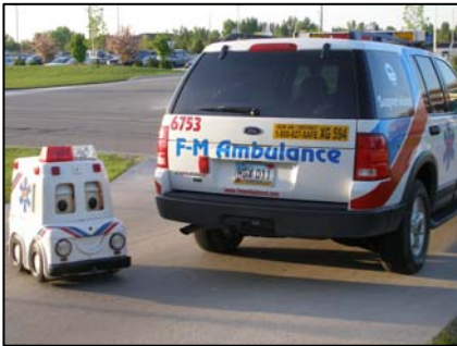
Andy the Ambulance took a break next to 6753 during the open house

Ambulances, fire trucks, police vehicles and many other things lined the F-M Ambulance parking lot on Wednesday May 17 th for the 3 rd annual EMS Week Open House. There were between 200 – 300 people that showed up to help celebrate national EMS week.