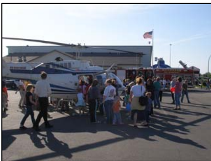
Many people enjoyed touring the Lifelight helicopter