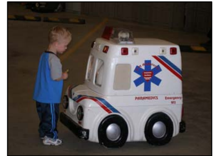
Andy the Ambulance enjoyed visiting with all of the kids at the open house