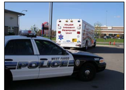
Many vehicles from different agencies were open for tours during the open house