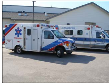
Ambulances from F-M and Casselton Ambulance were both available for tours during the open house