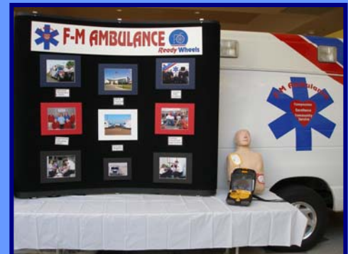
F-M Ambulance participates in "Law Day" at West Acres Mall on April 22 nd .

Hundreds of youngsters were at West Acres on Saturday April 22 nd for "Law Day". The kids had the opportunity to tour area emergency response vehicles, including cars from the Fargo, Moorhead and West Fargo police departments, Cass and Clay county sheriff's departments, and F-M Ambulance. Everyone seemed to enjoy touring the ambulance and the police vehicles and getting stickers and mini-first aid kits!