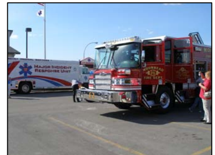
Both Fargo and Moorhead brought their fire trucks over for tours